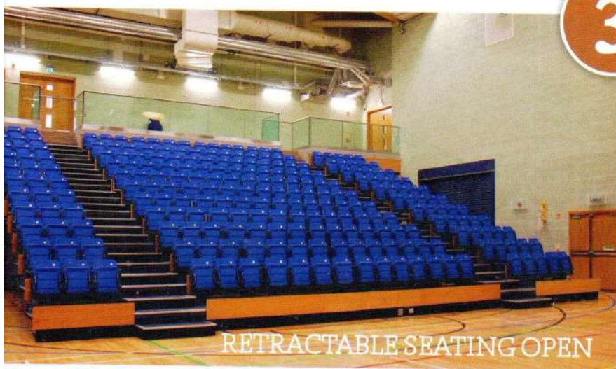
RETRACTABLE SEATING OPEN

manual alternative to the powered, push button system. The chairs are folded down onto the platforms using a detachable lever, in groups of three or four. Handles are then slotted into the front row of the system and the tiers are pushed back by hand. For small areas of retractable seating, this straightforward method of operation is perfect.