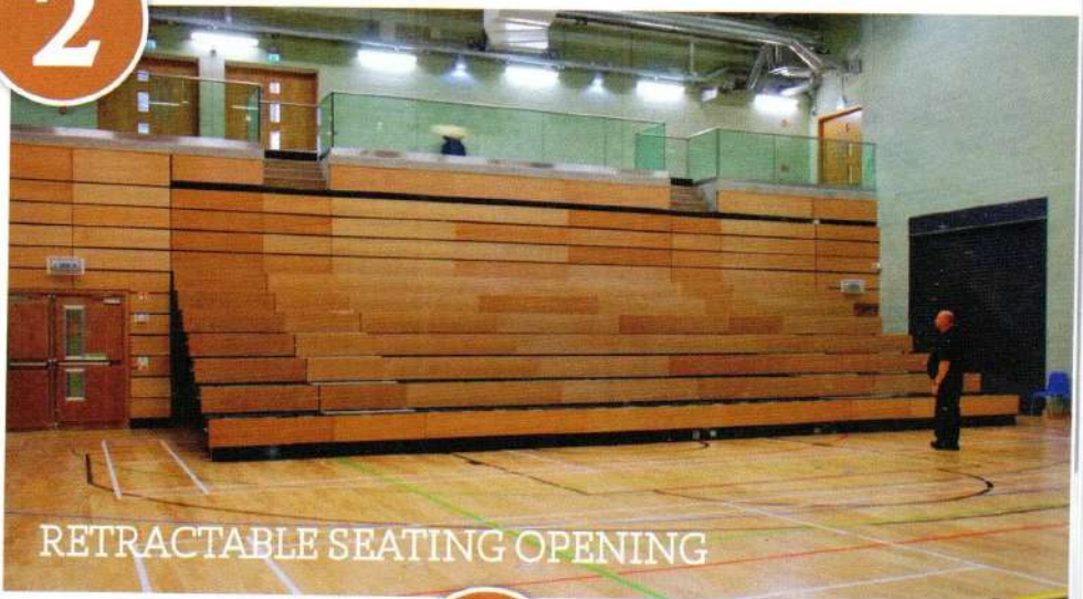
RETRACTABLE SEATING OPENING