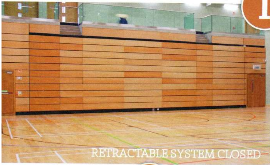
RETRACTABLE SYSTEM CLOSED